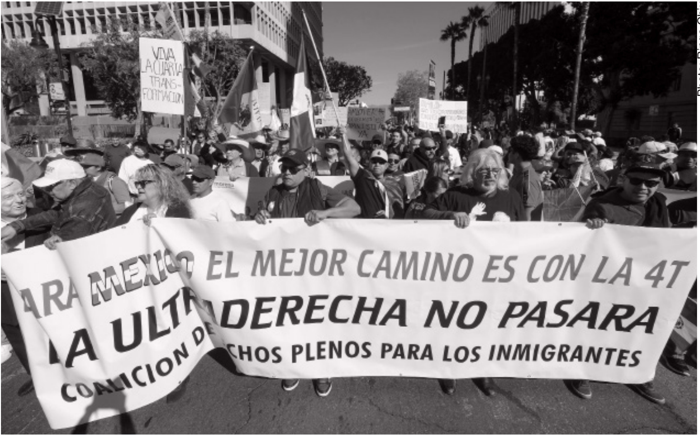
The “Full Rights for Immigrants Coalition” takes part in a rally to support political reform in Mexico, in Los Angeles.

of growing economic and social inequality, an inequality due to neoliberal policies that further enrich the wealthy while cutting programs that benefit the working class. As in the three previous Mexican revolutions, the 4T promises to lift workers and improve life for the most poor and marginalized.