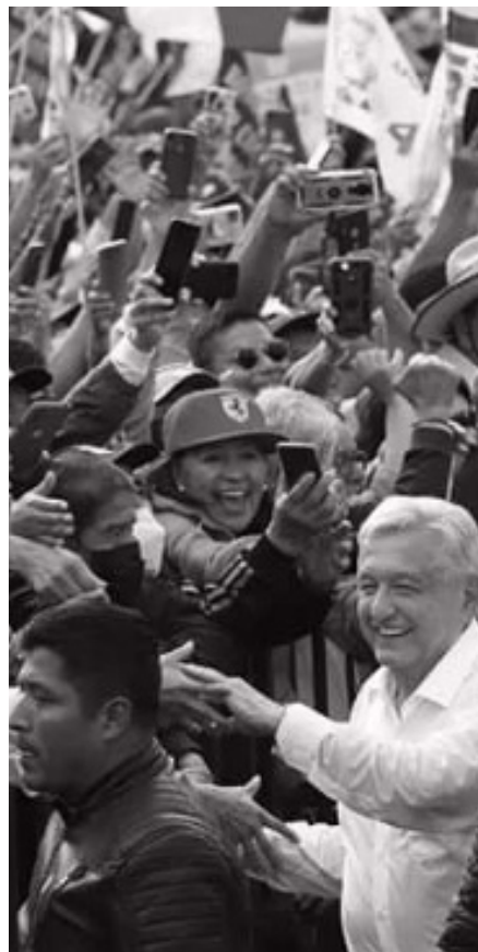
AMLO greets supporters in Mexico City.

Moreover, some see Zapatismo and national electoral projects as