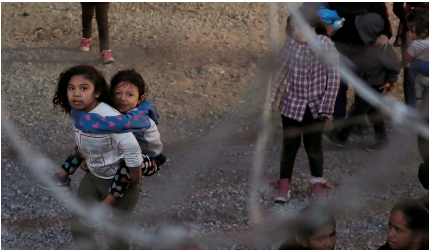
Very young children inside a U.S. Customs and Border Protection holding area in El Paso, Texas.

Trump’s previous attacks on immigrants outraged the souls of most people in the U.S. and the world. The kidnapping and incarceration in dog-kennel-like facilities of 3,000 immigrant children from Latin@ families seeking refugee asylum, haunts us. Hundreds of those children still remain separated from their families. The promised mass deportations will result in tens of thousands more children facing a similar fate. This is state political terror: threatening to harm a child if the adult does not cooperate. The Party of so-called “Christian” and “family values,” like the slave owners of the past, do not believe non-white families are fully