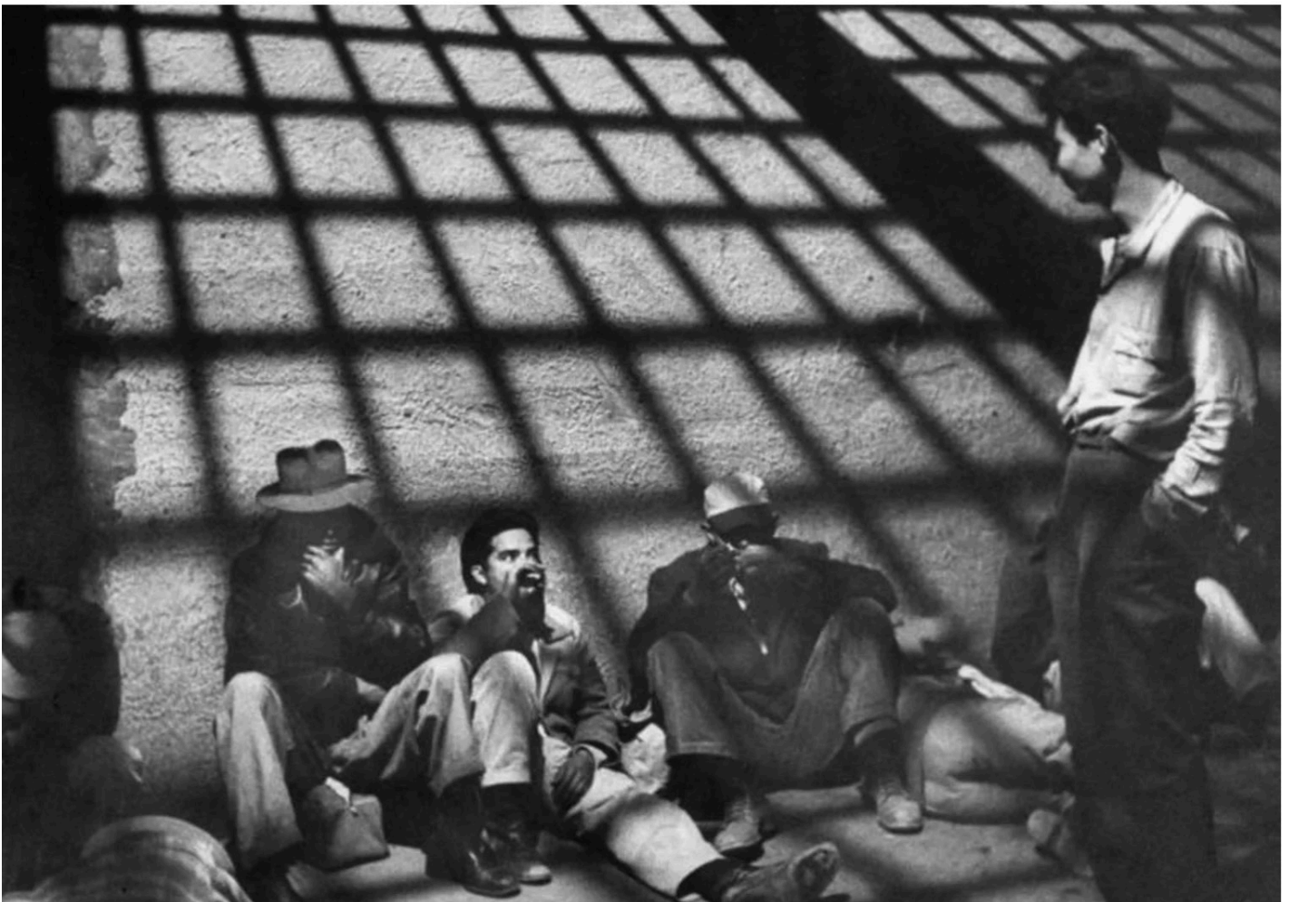
Mexican workers in the U.S., jailed and waiting for deportation as part of "Operation Wetback" in 1955.