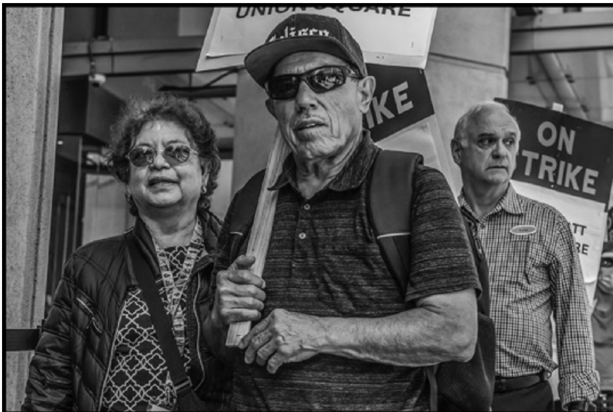
Over 1,500 hotel workers, members of Unite HERE Local 2, on strike against three hotels in San Francisco. September, 2024