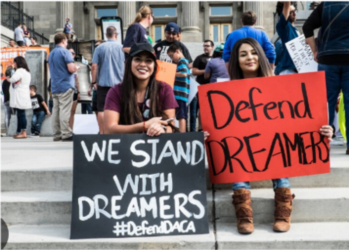
Texans in support of Dreamers.

immigration: On one hand, it continues to support the legalization of Dreamers (DACA) and pushes for a path to legalization for the spouses of immigrants with legal residency. On the other hand, it has denied asylum protections for refugees crossing the southern border and supported legislation for increased militarization as well as new administrative hurdles. While our most important fight is against the MAGA Right, the fight for full rights and protections for immigrants is a long-term struggle beyond the November elections.